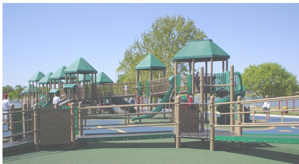
Handicap Accessible Children's Park Lubbock, TX