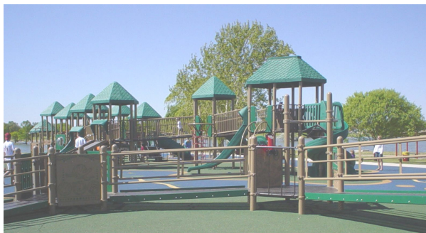
Handicap Accessible Children's Park Lubbock, TX